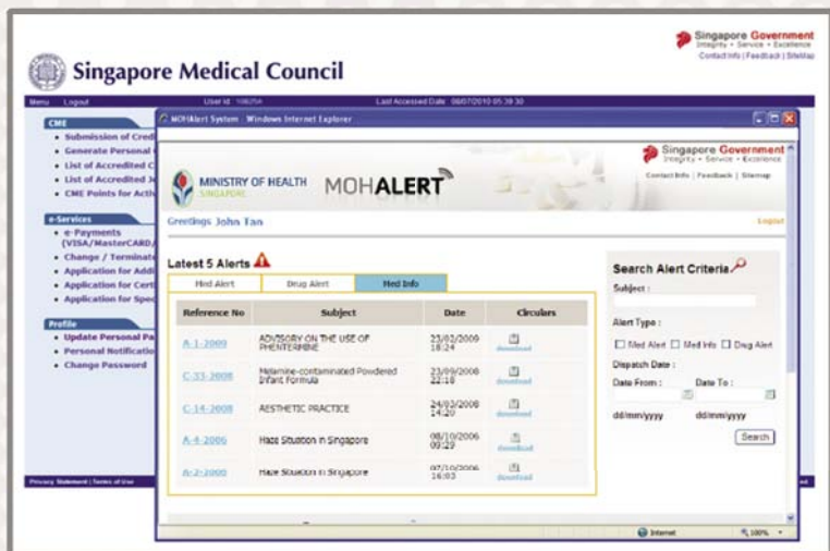
Figure 3 : Sample MOHALert website accessed through SMC