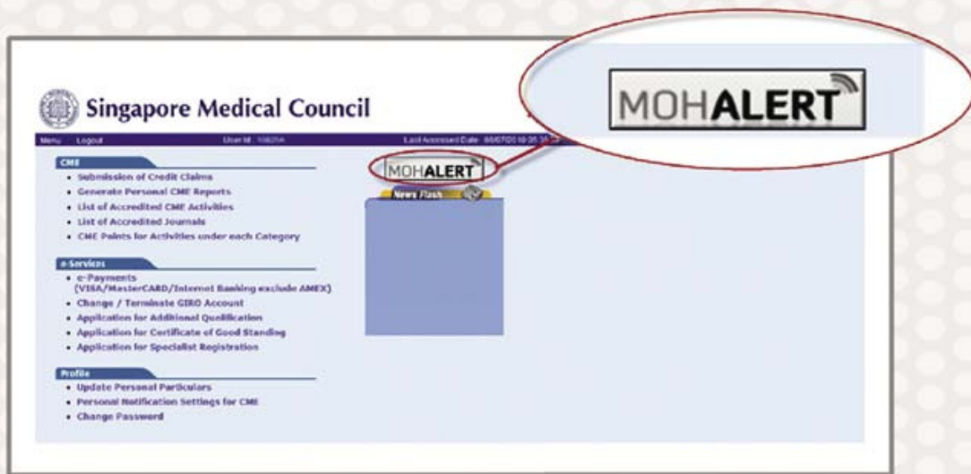
Figure 2 : Sample MOHALert icon