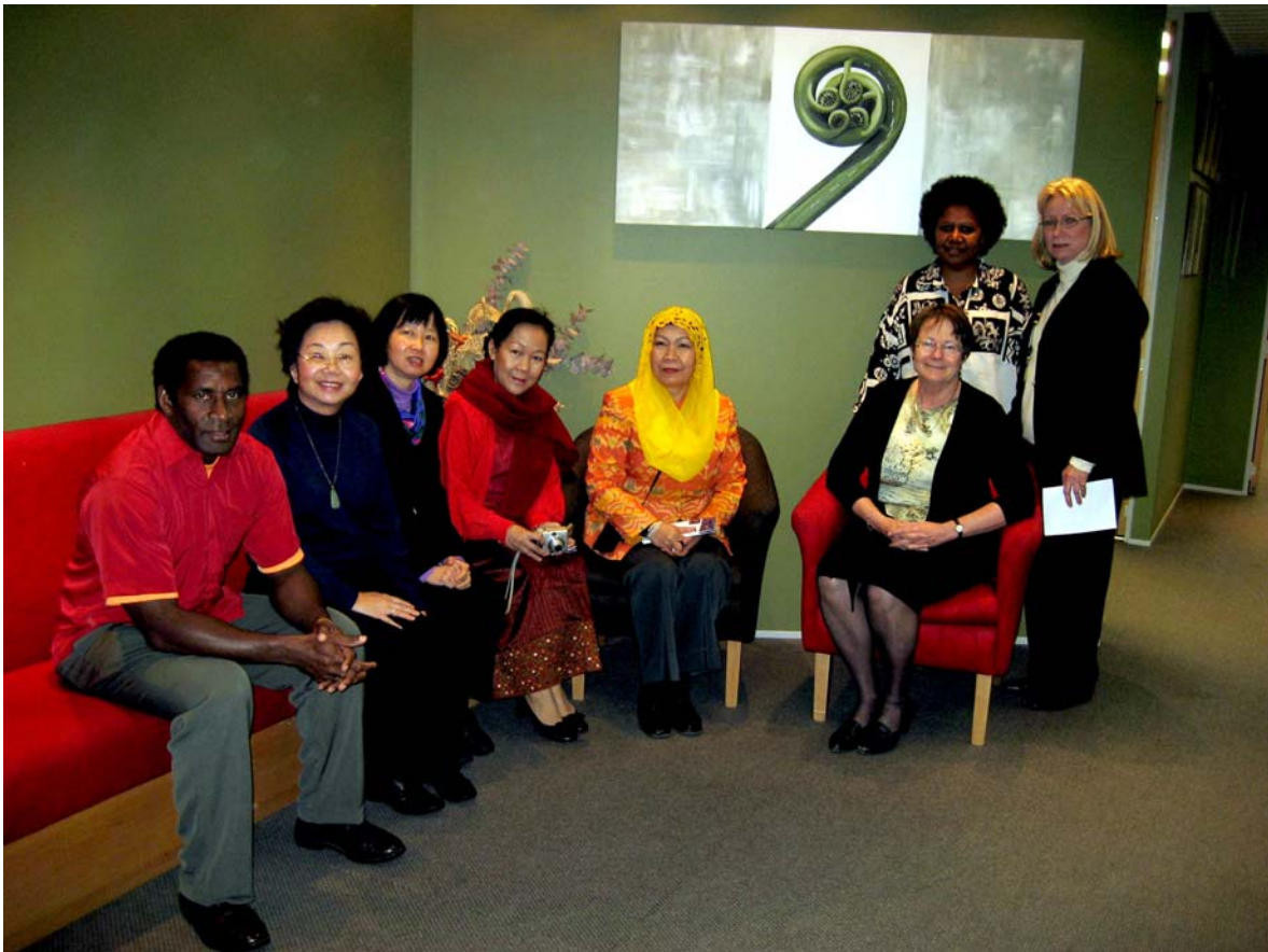
Visit to the Nursing Council of New Zealand by Registrar with other delegates during the WP/SEAR Meeting in Wellington.

Registrar and Executive Secretary attended the 6 th Meeting of Regulatory Authorities from the Western South East Asian Nursing and Midwifery Regulators Meeting (WPSEAR) held in Wellington, New Zealand from 18 to 20 September 2006. There was a diversity of experiences ranging from countries with established Board practices and some countries about to embark on establishing a regulatory framework for nurses. Singapore has accepted the invitation to host the next WPSEAR meeting in 2008.