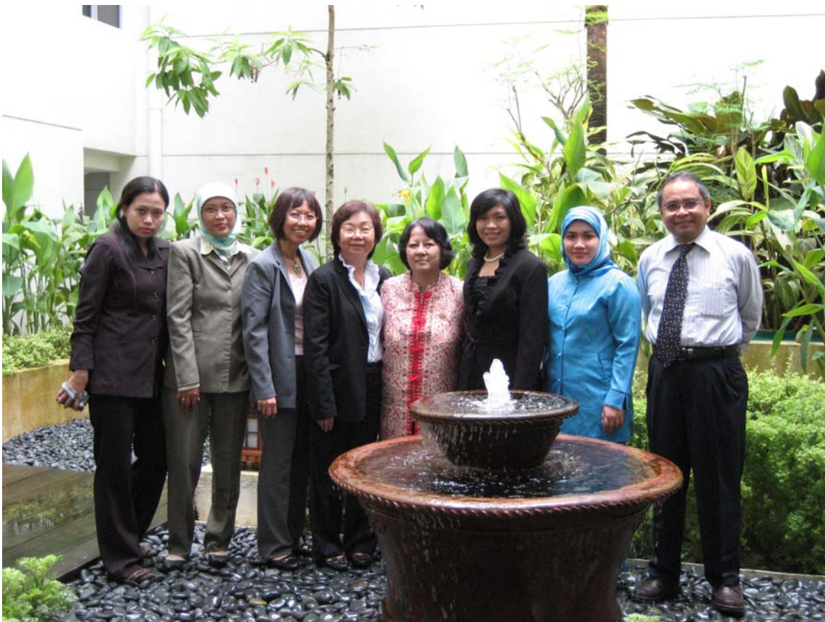
Visitors from the A Yani School of Health Sciences, Indonesia

On 28 th December 2006, a delegation from the A Yani School of Health Sciences visited the Board to learn more about the regulation of nurses in Singapore.