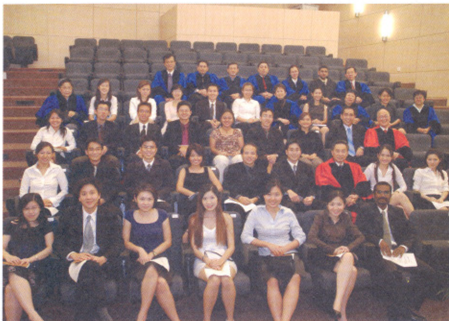
Newly registered dentists with members of Singapore Dental Council