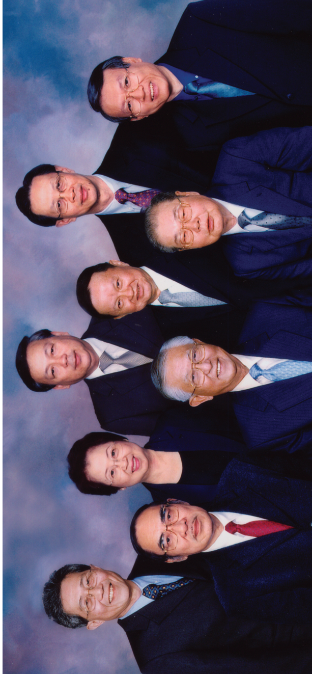
Back row from left to right (后排由左到右)