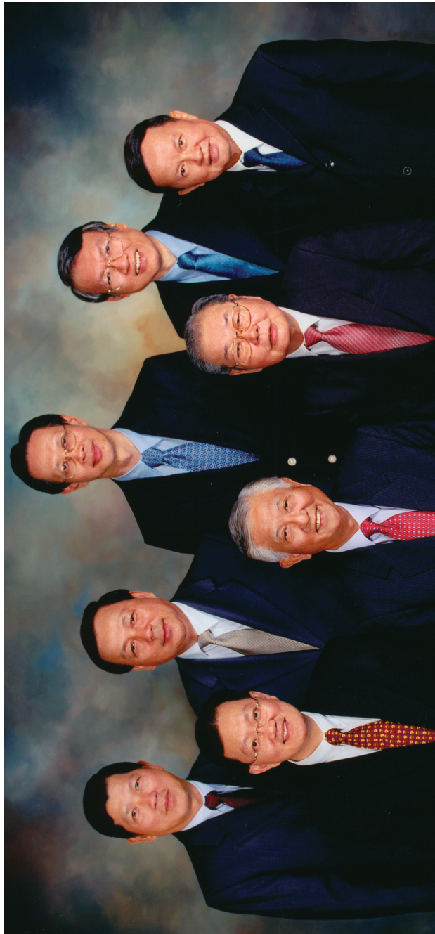
Back row from left to right (后排由左到右)